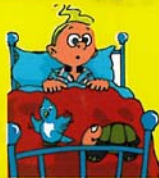
Geiriau pob CD ar y cloriau Words of all the CDs on the covers

Ar gael yn eich siop leol neu ar-lein drwy www.fflach.co.uk ac ar iTunes Available from your local shop or online through www.fflach.co.uk and on iTunes