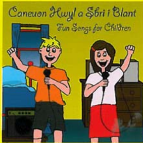
Caneuon Hwyl a Sbrî i Blant CD308L

Dyma ddeuddeg cân gan wahanol artistiaid gyda chaneuon bywiog i blant hŷn (tua 7-11 oed). Caneuon yn cynnwys Torth Fach Frown, Mobile yn fy Mhoed, Twrci Tew, Dilyn Man, United a Canu Roc a Rôl. Mae'n hysgrifedig un cân o'r CD poblogaidd Siani Shetland. Hon yw'r CD defnyddiol i gyd-ganu gydag e.